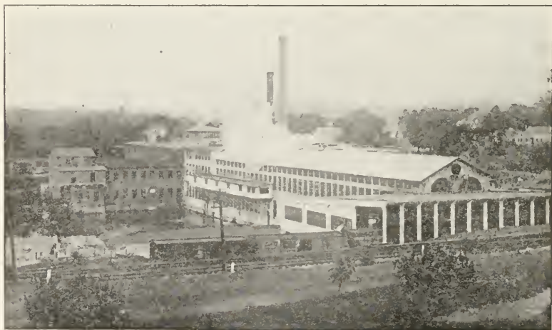
Pulp Mill, South Windham, Maine